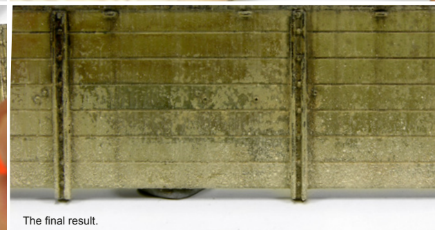
The final result.