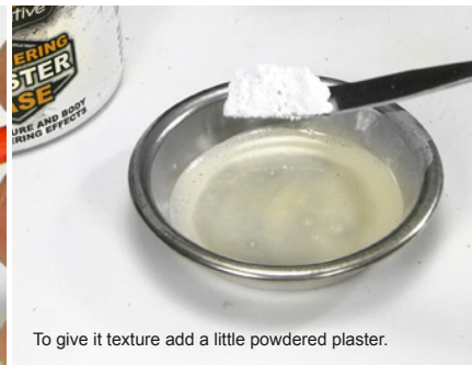
To give it texture add a little powdered plaster.