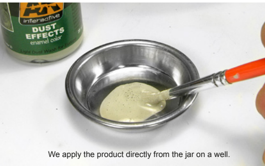
We apply the product directly from the jar on a well.