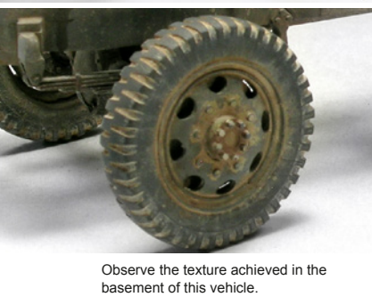
Observe the texture achieved in the basement of this vehicle.