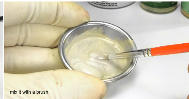
mix it with a brush.