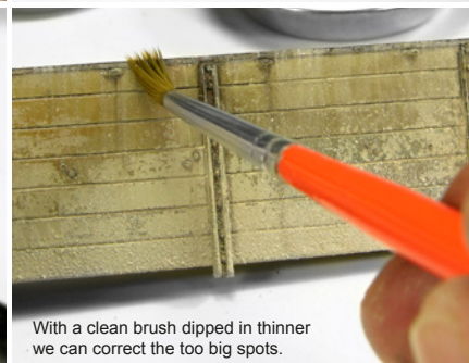
With a clean brush dipped in thinner we can correct the too big spots.