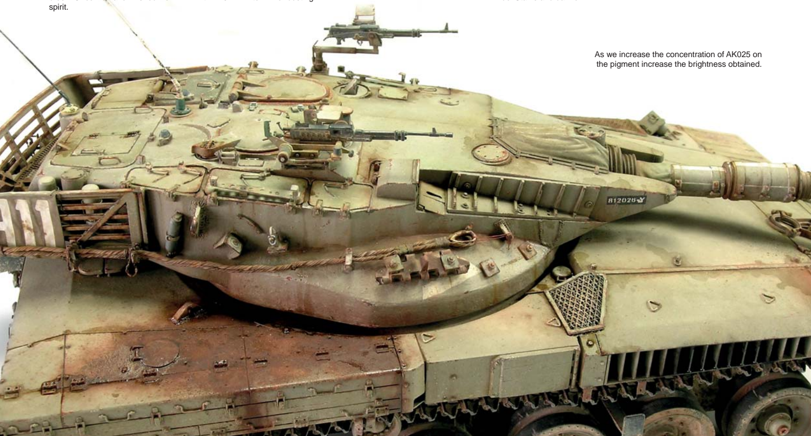
As we increase the concentration of AK025 on the pigment increase the brightness obtained.