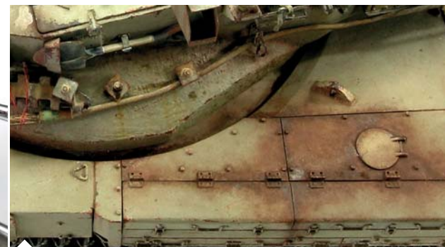
Appearance after application of the product in combination with AK025 Fuel Stains and dark oil.