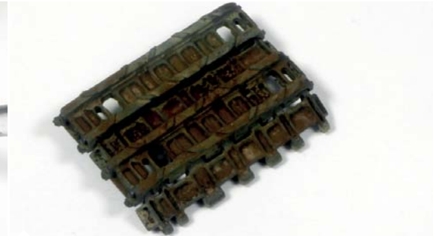
When dry you get a dark corroded rusty aspect of the tracks.