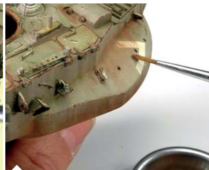
Mixed with light pigment, this time, it has also been used for dusting.