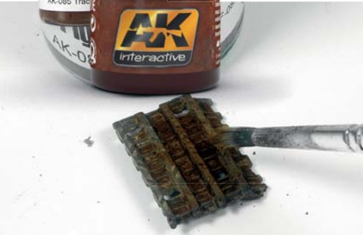
Apply the pigments dry with a brush.